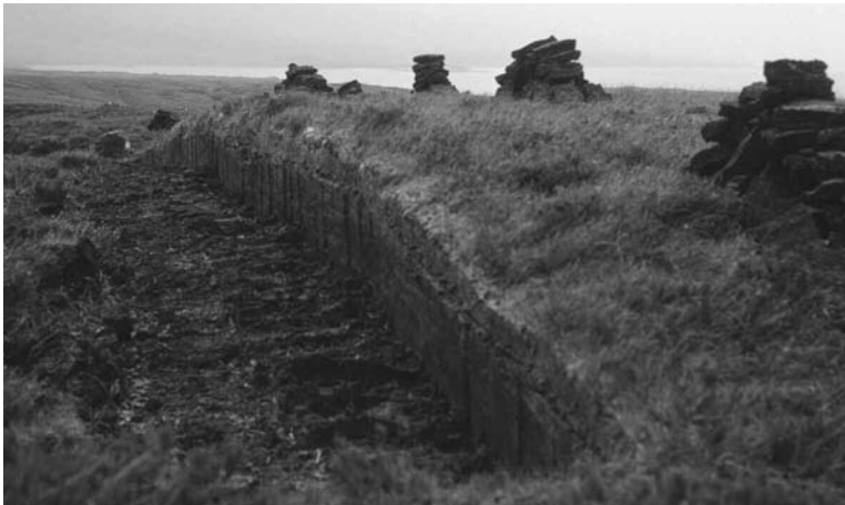
Turf-Cutting in a Scottish Bog.