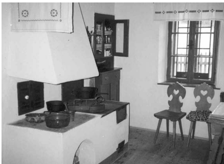
Czech Kitchen Stove: The Miller's House Museum, Carpathian Mountains, Moravia. Viewed from front and back.